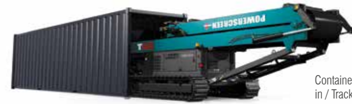
Containerised shipping, Track in / Track out. No crane required.